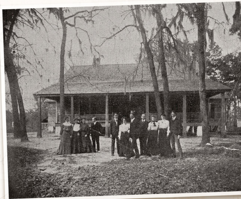
Homestead circa 1900