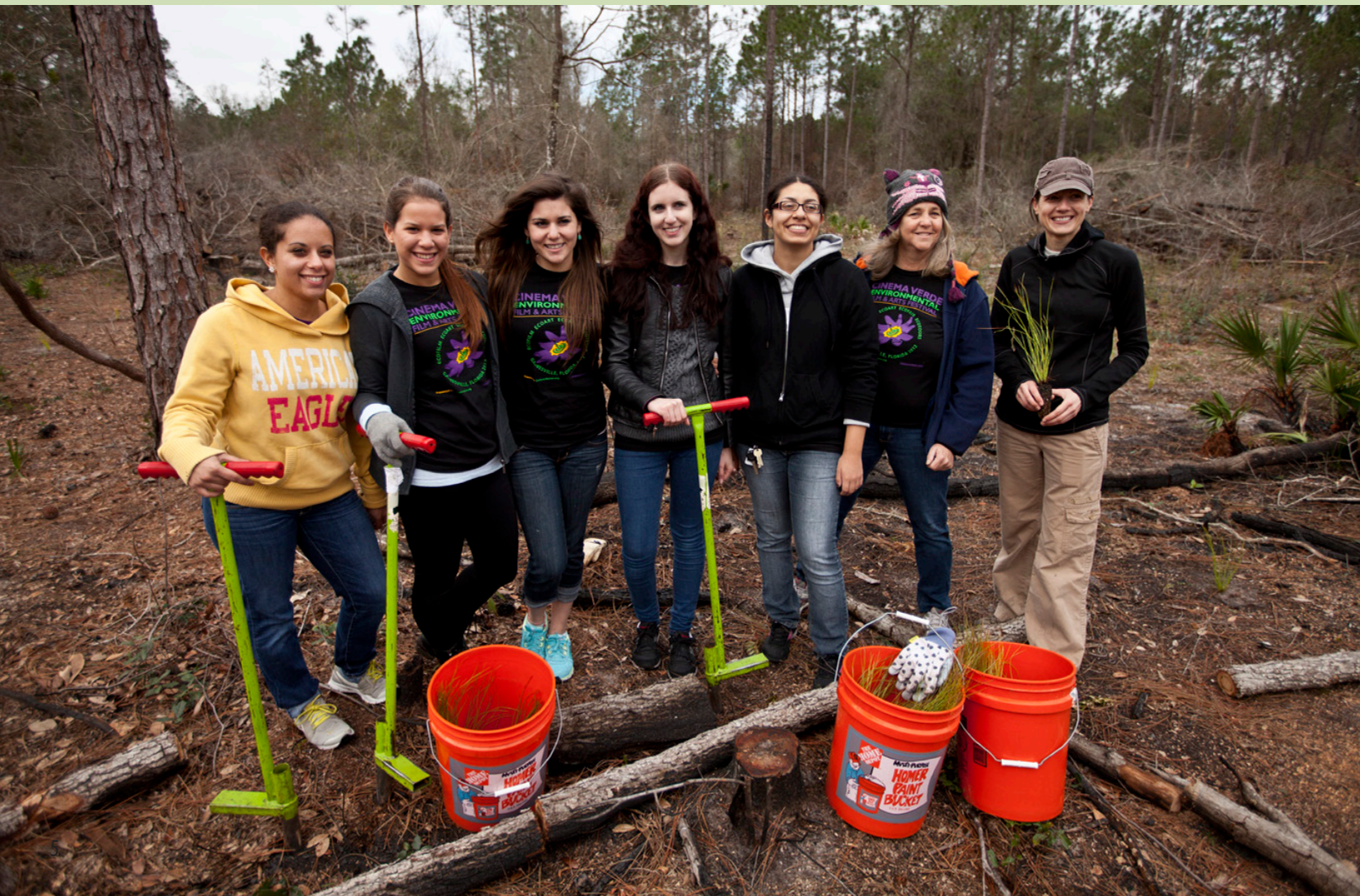
Photo (below): Crew from Cinema Verde, coordinated via Earth Givers, helped ACT plant longleaf pines within a restoration area on Prairie Creek Preserve. This section of the preserve was previously pine plantation that had become overgrown with various hardwoods. ACT, with help from various partners, has cleared out many of the non-native pines and encroaching hardwoods, and is currently planting natives.

Another priority this year will be the planning and execution of improvements necessary for the opening of our newest preserves, Santa Fe River Preserve near Worthington Springs and Little Orange Creek Preserve northeast of Hawthorne. Along with habitat restoration, making conservation lands accessible to the public for outdoor recreation is a primary management goal of Alachua Conservation Trust, and we hope you will continue to support our efforts in north central Florida.