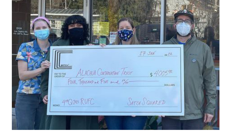
SATCH SQUARED Round Up For Charity

A big thanks to Satch Squared which raised over $4,000 for Alachua Conservation Trust's Internship programs through their Round Up For Charity (RUFC) fundraiser in 2021!