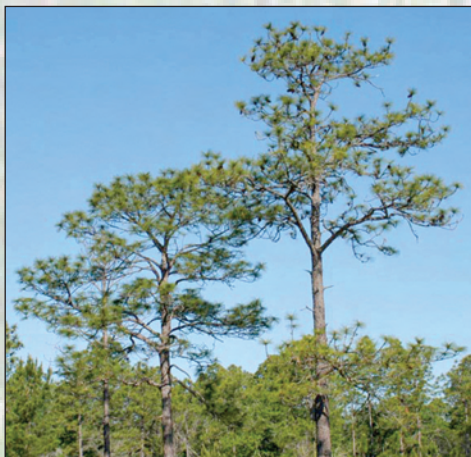
The Longleaf Ecology and Forestry Society (LEAFS) has launched its new website at longleafs.info to promote Longleaf Pines in reforestation.

Got a good nature joke? Email it to ACT: Info@AlachuaConservationTrust.org