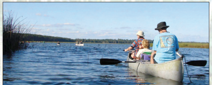
Canoers on the Potano Paddling Trail in Newnans Lake.

Have you kayaked the Potano Paddling Trail recently? Or hiked to the cypress swamp at Prairie Creek Preserve? Or spied the wildlife at Tuscawilla Preserve? ACT would love to hear your stories and see your pictures. We may even use them in future newsletters, on our website, or on Facebook. If you would like to help spread the word about ACT by sending us your stories and photos, please email us at Info@AlachuaConservationTrust.org , and let us know that we have permission to use your material. Thank you for your support, and for getting outdoors to enjoy our incredible natural environment.