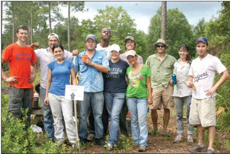
Volunteers planted 2000 Longleaf Pine seedlings at Prairie Creek Preserve for the Revolving Tree Fund.

Again this year, ACT had the help of the Young Entrepreneurs for Leadership & Sustainability, a summer program for high school students. This program is run by the University of Florida's Center for Entrepreneurship and Innovation in the Warrington College of Business. Students helped rake fire lines for prescribed fire (above), removed fencing, and planted longleaf pine seedlings. Photo by Ivor Kincaide.