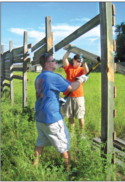
In August, over 30 incoming first-year law students helped remove fencing near Prairie Creek Lodge. Before ACT purchased this 750-acre property in 2009, it was used as an exotic game ranch.