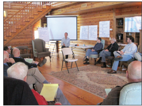
The Alliance of Florida Land Trusts, with member organizations from the panhandle to South Florida, met in February at Prairie Creek Lodge to discuss the future of conservation in Florida.