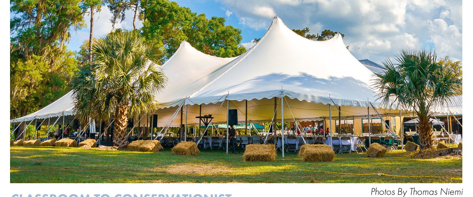
CLASSROOM TO CONSERVATIONIST 2023 Conservation Stewards Awards Honors Community Educators

O n Saturday, March 25th, ACT hosted its Annual Conservation Stewards Awards at Prairie Creek Lodge. Each year, this event honors individuals in our community who are influential in a wide variety of ways – the arts, historic preservation, and particularly, in protecting our wildlife and natural resources. The Conservation Stewards Awards is the largest gathering of community leaders and supporters of wild Florida in the region. This year, over 500 guests were treated to dinner, drinks and a musical performance from Gainesville-based Sooza Brass Band. All funds from the sold out event supported ACT's work towards land conservation.