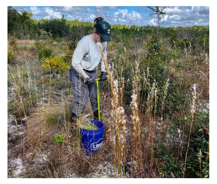
FOR THE BIRDS North Florida Sandhills Grassland Bird Restoration Project

This part of the river and sections of the nearby New River are designated "critical habitat" for two federally listed mussels - the endangered oval pigtoe and the threatened Suwannee moccasinshell. This project is one of many that ACT is working on within the Santa Fe River Corridor. ACT is working to protect 75,000 acres of land in the Santa Fe River Basin by 2045. Please join ACT and help reach this goal by making a donation online.