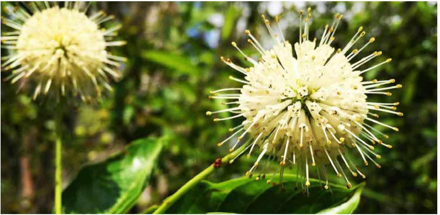
Cephalanthus occidentalis commonly known as the Button Bush